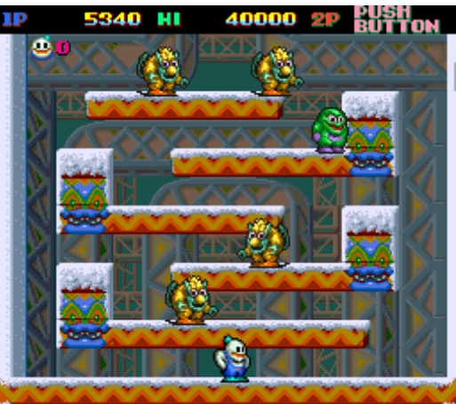
(The fire breathing frog, beware!)

While it is a fun one player game, it really shines as a two player game! It is almost mandatory that you have two people as the game can be quite difficult. Not only are you outnumbered 5-1, but it takes quite a few hits to turn a creature into a snowball. Think of Dig Dug and the amount of effort you needed to pump up a creature and you have somewhat an idea of how time consuming it can be to defeat your foes. This also leaves you open to attacks, so you must be careful.