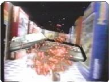
OH! THE IRONY!