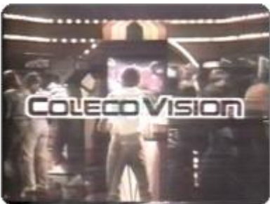
Again this is NOT an Atari ad.

"This is the arcade experience on your Colecovision, and we bring the arcade experience home. With arcade graphics like Donkey Kong with multiple screens, just like the arcade game. Arcade controls, and Colecovision is an expandable system. Plug in the first Expansion Module and play all Atari VCS compatible cartridges. More arcade games than any other video system. Now, bring the arcade experience home because YOUR VISION IS OUR VISION. COLECOVISION!"