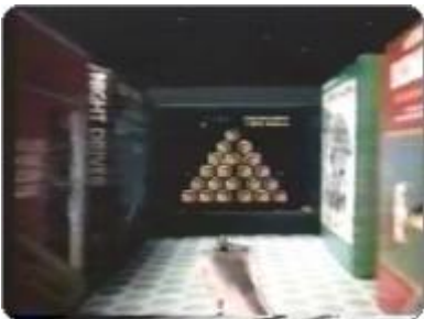
We're now flying into some Atari game screens.