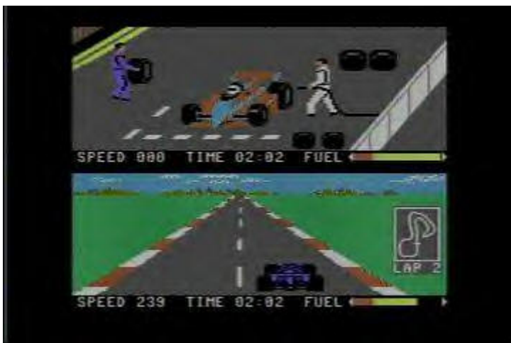
My own screen shot showing the C64 split screens on "PitStop II".

My first reaction - Did the crash prevent us from seeing a CV "PitStop II"? The Gameplay is superb (9), with better physics, more aggressive computer drivers & the bumping really slows you down. The Addictiveness is very good (7), scoring better with more realistic drivers and greater difficulty. The roadway is a bit narrower & the computer drivers are actually aggressive & more plentiful. Sometimes harder does not mean better - but after all, what's the point of the PitStop if the race is too easy? Trade off: Driving slower/safer, or like use the pit & be a dare-devil. The use of the CV driving controller also doesn't hurt to give you that extra replay or thrill. The Graphics are impressive (8), probably the best - with multiple colored computer cars. The tire colors, although a bit loud & unrealistic, makes them the easiest to determine wear. The Sound is very good (7). The Controls score a perfect (10), since there is no pause, you can choose any controller. This cart is a little hard to find, but well worth it for CV fans.