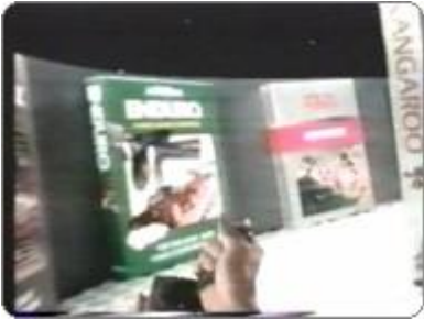
Look at all the boxes. Must be an Atari ad.