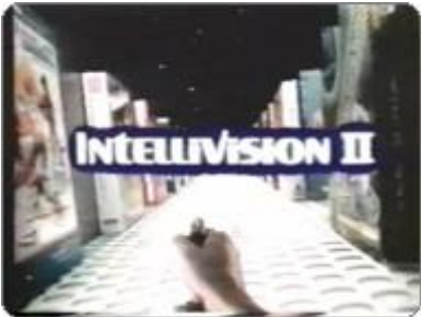
WHAT?! This isn't Atari?!