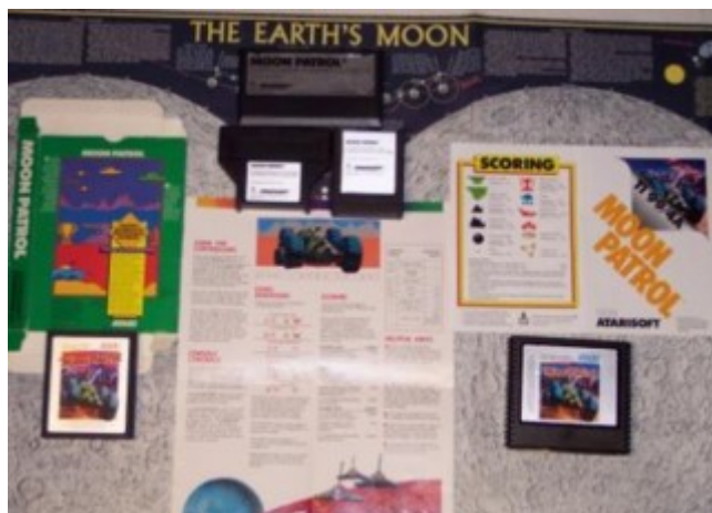
Many Faces collage with non-scrolling background - 1969 National Geographic Map of the Moon.