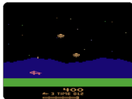
Moon Patrol on Atari 2600