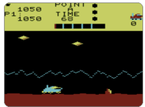
Moon Patrol on Commodore Vic-20