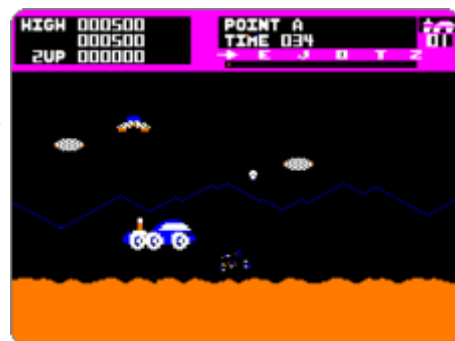
Moon Patrol on Apple II