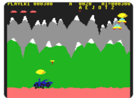
Moon Patrol on Commodore 64

Graphics are beautiful (8), not quite as detailed as the Atari, but having more clarity in the sprites, animations and shots/bombs fired. There's good color variety, nice scrolling from the foreground and two backgrounds, everything is multi-colored, the animations are OK, and this has the best screen layout. The small status area is missing the 3 (useless IMHO) warning lights, and "Caution", but could have been a little more detailed without sacrificing screen space. Sound is wonderful (9) with no effects missing and pretty nice music and jingles throughout. Controls are perfect (10).