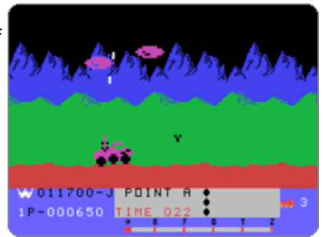
Moon Patrol on TI 99/4