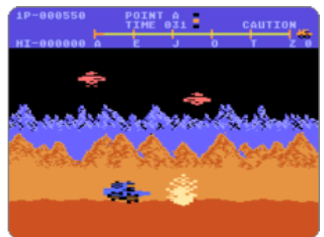
Moon Patrol on Atari 5200 & Atari 8-bit

My first reaction was this is pretty much the same game as the Atari 8 bit. Without knowing for sure, this was probably planned or coded first. Nearly all comments and scores are the same (see below) - except for the Controls - scoring an (8). The analog stick is difficult to use - to keep adjusting or getting the stick in just the optimal L/R spot for any one jump, yet alone sequential jumps. To make things a bit different, the 5200 is programmed to use one fire button to fire weapons and the other to perform a jump. Although this setup is great when all you are doing is jumping, but it doesn't seem to work for me when I need to fire rapidly and jump at just the right time . . . and not jump by accident. Using a Wico controller - I still struggled. With the Masterplay Interface (MI), even though it defeats the analog aspect, you now have no means to jump. You need a second fire button. So, add a point or 2 to the score (and let me know) if there is a compatible two-fire-button controller that works here. The pause is of course toggled by <pause>.